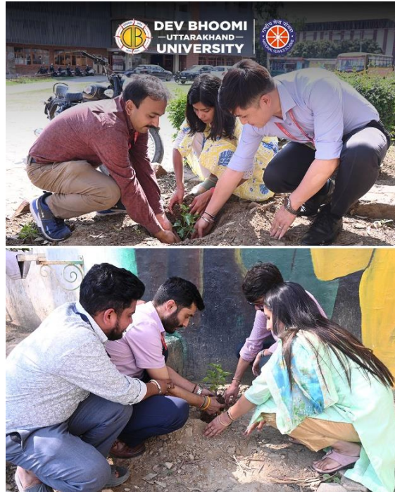
Picture of sapling planted and plantation drive conducted