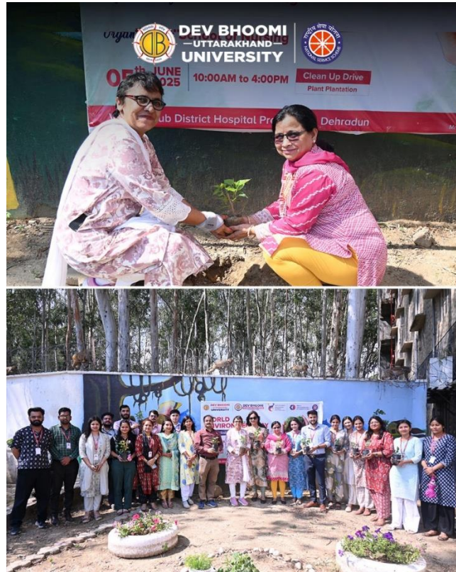
Faculties in plantation drive holding the saplings

(Notified by Govt. of India u/s 2(f) of the U.G.C. Act, 1956)